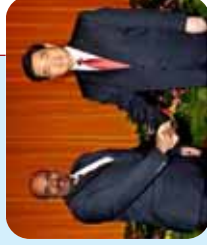
President Omar al-Bashir of Sudan meets with President Hu Jintao of China