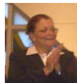
Dr. Alveda C. King

This year's theme was based on Dr. King's March 25, 1965 Selma to Montgomery Speech on the steps of the State Capital titled Our God is Marching On! Excerpts from Dr. King's speech were recited by three seventh grade students from Posen's St. Stanislaus