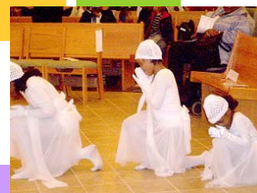
The Holy Name of Mary Liturgical Dancers